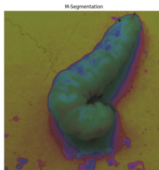
Fig. 3. M-segmentation

The performance indicators of a classification model are displayed in the classification report. The precision ratio is the proportion of accurately predicted positive cases to all positive instances that were forecasted. The fraction of genuine positive events that were accurately detected is called recall, also known as sensitivity. The harmonic mean of recall and accuracy is the F1-score, which offers a fair comparison of the two. The dataset's "support" is the actual number of instances of each type. The model performs fairly well in the context of the supplied report, obtaining 99% accuracy. The model has a great capacity to reliably identify both classes, with few false positives and false negatives, according to the values for accuracy, recall, and F1-score. The weighted average takes into account class proportions, whereas the macro average computes the metrics' overall averages across classes. In this particular instance, the model has good prediction ability, successfully separating the classes under investigation.