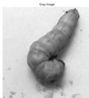
Fig. 4. Gray image

In image classification for silkworms, M-segmentation divides an image into understandable chunks according to common traits. This method makes use of sophisticated algorithms to extract distinguishing patterns from photographs of silkworms, assisting in the identification and classification of various locations within the photos. The complexity of categorization is decreased by image segmentation, allowing for a more accurate study and classification of silkworm-related characteristics.