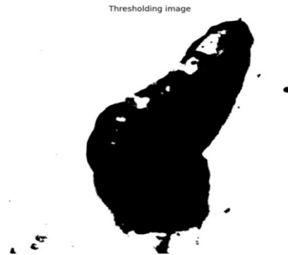
Fig. 5. Threshold conversion

To classify silkworm photos, colorful representations of the creatures are converted into grayscale versions. With this conversion, the image's color channels are combined into a single channel that represents the range of grayscale intensities. The classification algorithm may concentrate on the crucial structural and textural characteristics of the silkworms by simplifying the image in this way, enabling more accurate and efficient categorization. Grayscale conversion streamlines the processing needs for classification tasks while improving the model's capacity to differentiate silkworm patterns and traits.